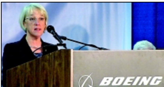
Speaking at a tanker rally in Everett, Senator Murray told of legislation she introduced to require the Pentagon to include illegal subsidies EADS received as one of the bid criteria.

"But here's what it means if we win," he said. "We get the contracts at the end of this year and we start building planes in Everett."