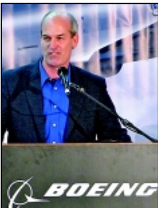
U.S. Rep. Rick Larsen knows the need to consider illegal subsidies in any tanker decision and noted if Dino Rossi had to clarify his answer on this issue — he’s not ready for U.S. Senate.