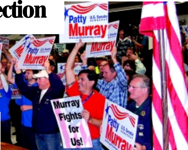
Above: Hundreds of Union members packed the Seattle Hall and pledged to help ensure Patty Murray remains our voice in the U.S. Senate.