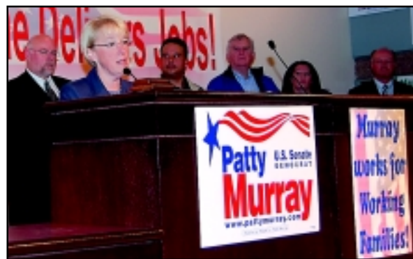
Senator Patty Murray energized a crowded Seattle Hall asking members to help get her re-elected so she can continue fighting for working families.