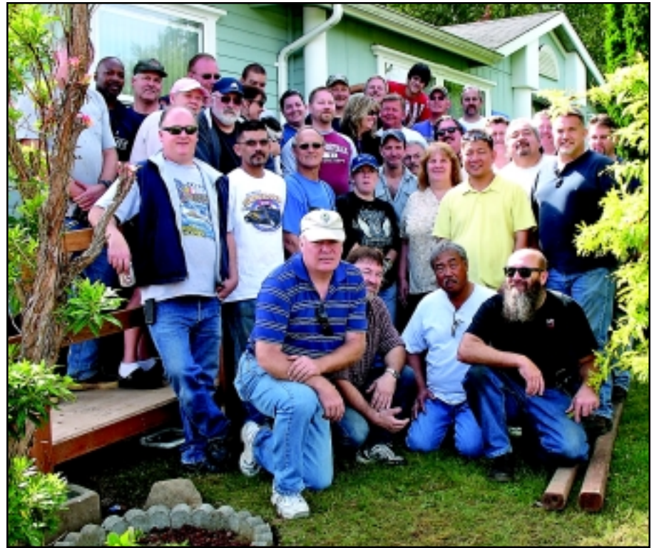
Above: The volunteer crew pose for a photo after completing the ramp and other cleanup tasks at the home. Nearly 40 volunteers turned out to help – making it a real team effort.