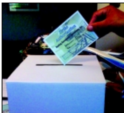
BAO members voted 92 percent to grant strike sanction while DynCorp L3 had an impressive 100 percent strike sanction vote.