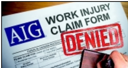
I-1082 is actually a massive power grab by the insurance industry to turn our state run workers’ comp system into a for profit system ran by companies like AIG.