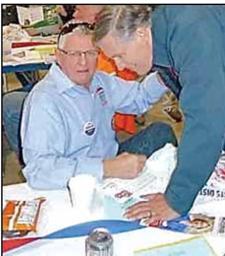
Inslee mingles with labor activists.