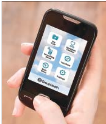
Group Health members can now access their care with using a new mobile app for smartphones to provide care on the go.