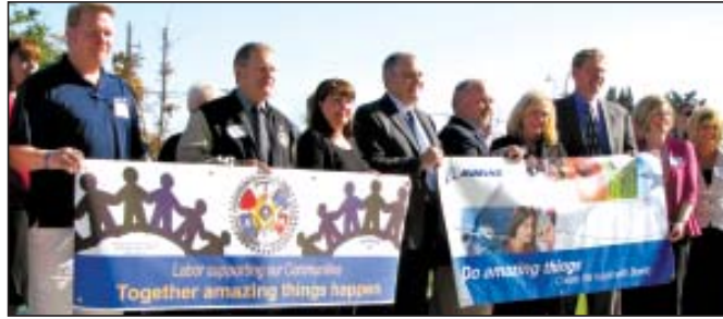
The Machinists Union and Boeing partnered on the effort that brought Yakima Valley Tech a new manufacturing skills center. At the press event, Machinists Union and Boeing officials said they hope to inspire students to seek a career path in aerospace manufacturing.

The Yakima Valley program is a pilot; once the curriculum has been estab-