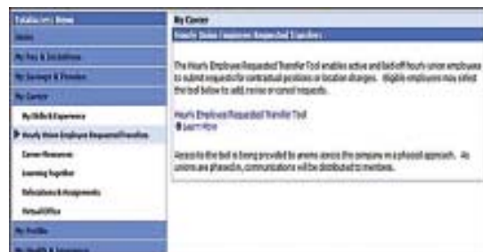
Effective October 21, hourly members file Category A, Category B, and Category C filings online. Members can access this tool by clicking on the hourly Employee Requested Transfer Tool in TotalAccess from their work or home computer.

MVPs from District 751 regularly volunteer to serve meals at rescue mission in Everett and Tacoma, and they also help sort food at Northwest Harvest's warehouse in Kent.