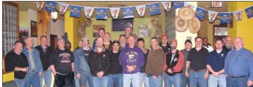
Members working at URS Whidbey are smiling at the benefits of joining the Machinists family and having a Union contract. Above some of the members joined Union leadership earlier this year for a celebration shortly after the workers voted to have IAM Representation.

As 2012 approaches, I urge each of you to join me in an effort to respect our shared past, and protect our mutual future. Working together as a union, we can ensure that Boeing – and its union workforce – will remain successful for generations to come.