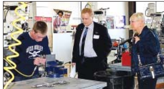
As part of the celebration at Yakima-Valley Tech, attendees got to tour the shop to see the new manufacturing training up close and talk to students about their future.