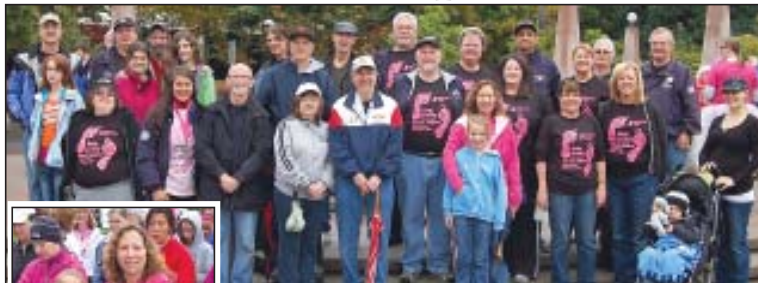
Above Team 751 volunteers at the Making Strides Against Breast Cancer walk on October 9.

As the year winds down, union volunteers are gearing up for two of the MVPs largest annual events: bell-ringing for the Salvation Army at Westlake Mall in Seattle on Dec. 2, and the KING 5 Home Team Harvest food drive to benefit Northwest Harvest on Dec. 3.