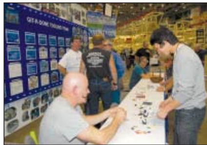
The 747-8 Tool Construction/Manufacturing Services: Git-R-Done took the Everett Site Award. A steady stream of people visited their booth to hear about their innovations. Look for a feature of their efforts in the next Aero Mechanic.