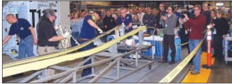
Members from the Renton factory applaud, as 751 members load the chords that signal the rate increase to 35 737s per month on October 18.

driver of the new automated tool that built the first spar at the new rate has spent 15 years building 737 wings.