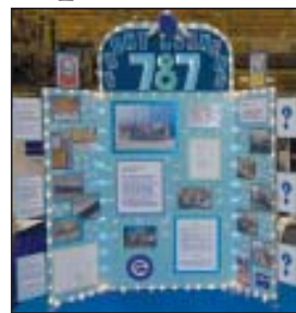
787 Front Runners was a favorite.