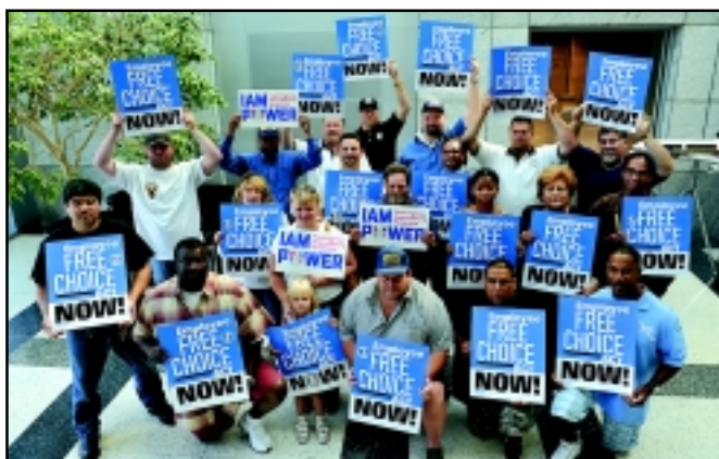
IAM leaders at Placid Harbor show their support for the Employee Free Choice Act.

All workers should have the freedom to decide for themselves whether to form unions to bargain for a better life. It's time for change in America. It's time for the Employee Free Choice Act.