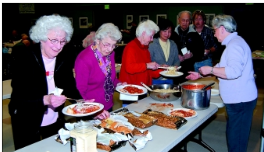
Retirees dish up a hot spaghetti lunch.