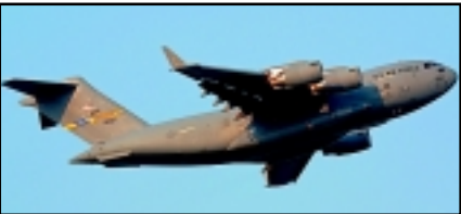
Boeing employees working on the C-17 at McChord voted unanimously for IAM representation.

Forty-one Boeing employees working on the C-17 Globemaster III program at McChord Air Force Base near Tacoma, Washington, voted unanimously for IAM representation in an NLRB election held February 18. The decision marks a great start to a national campaign aimed at bringing the benefits of being union un-