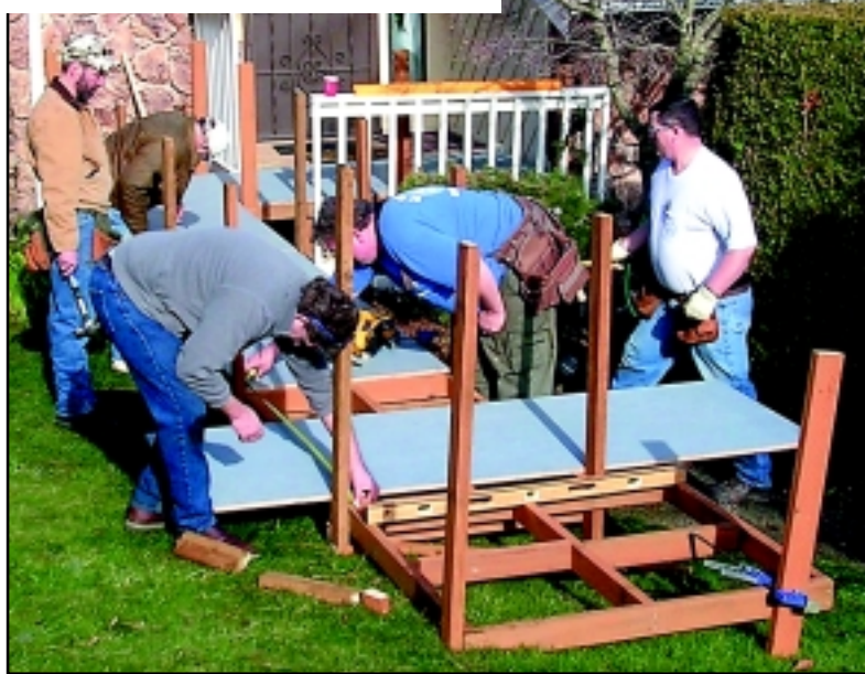
Below: Constructing the ramp.