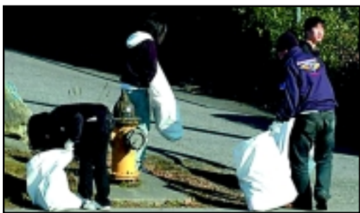
Photos above & left: volunteers clean up our stretch of Casino Road in Everett.