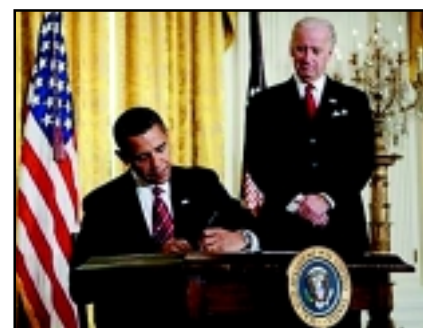
Vice President Biden looks on as President Obama signs pro-labor executive orders that reversed Bush-era anti-worker executive orders.

President Obama continues pushing for the much-needed EFCA legislation and responded, "I don't buy the argument that providing workers with collective-bargaining rights somehow weakens the economy or worsens the business environment. If you've got work-