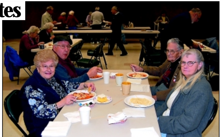
Every Monday at noon, those attending the Retired Club meeting are treated to a free lunch at the Seattle Union Hall.