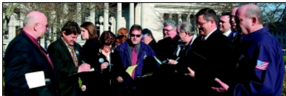
751 members gather outside the capitol in Olympia to split lobbying assignments for the Worker Privacy Act.