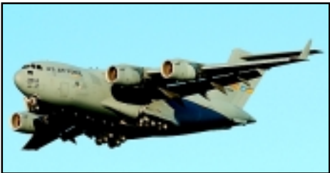
Boeing workers on the C-17 voted 100% for Union representation.

McChord Air Force Base is the home of Combat Airlift and has flown continuous combat airlift every day since October 2001. These elite members service the C-17 Globemaster III program, providing training to active military service men and women as Pilot Instructors, Loadmaster Instructors and Simulator Technicians.