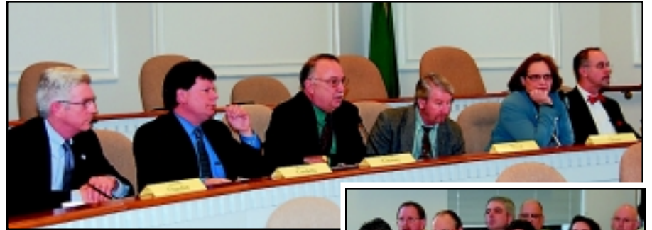
The House Commerce & Labor Committee hear testimony on the WPA.