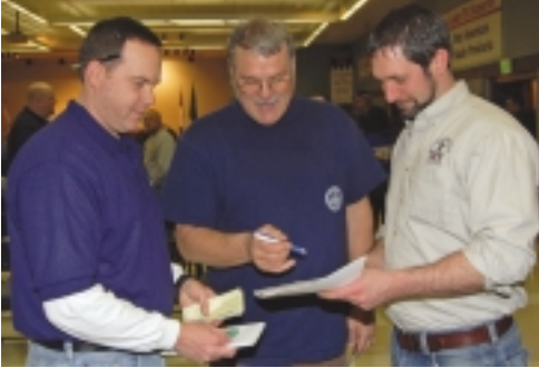
"We could not have picked a better group of outdoor enthusiasts with which to run the USA's first direct membership organizing campaign. If there's any group that Belongs, it's the members of IAM District 751."

Whether it's fins, fur or feathers that calls you, everything takes a back seat when the season opener rolls around. You're always ready to get out and experience the rich rewards of hunting, fishing and the great outdoors. Now you can join a community of union hunters and anglers from District 751 and from unions across North America who feel the same way through the Union Sportsmen's Alliance (USA) – a hunting and fishing club exclusively for union members, retirees and their families. Brought to you by the generous support of your Union, the USA is your club. When you join the USA, you're doing your part to help ensure future generations have a place to hunt and fish. You're also making a commitment to encourage friends and family to participate because more members means bigger and better benefits, discounts and sponsors. More member means sponsored hunting, fishing and shooting events. More members means a stronger, more unified voice to protect our right to hunt, fish and experience the great outdoors. So join today and help spread the word about the USA. Because as a proud member of both IAM District 751 and the sporting community, you're more than welcome. You Belong.