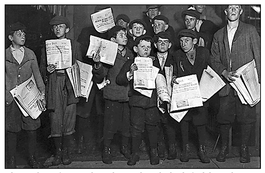
The newsboys of New York, aged 6-14, showed a level of solidarity that adult activists of their time didn't even come close to.

Paying the boys little, and requiring payment for issues upfront, the companies got their publications distributed for