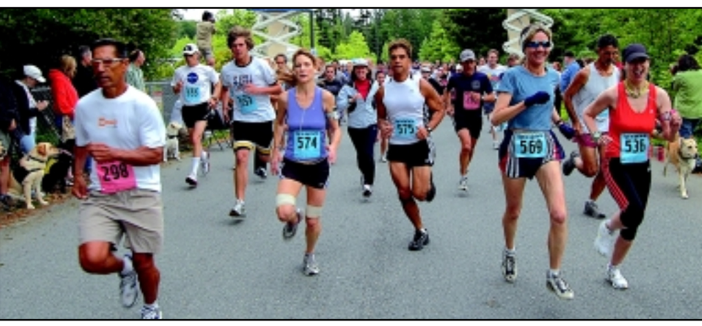
The Women's Committee did a great job of marketing this year's event - as was evidenced by the largest numbers of runners to date!