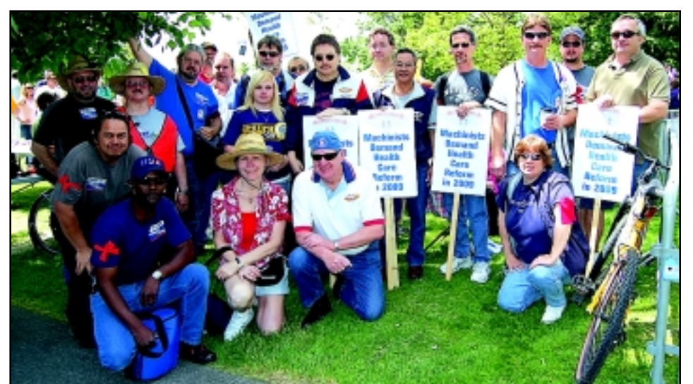
Some of the 751 members who participated in the healthcare rally on May 30th. Many served as marshals along the march route.

Healthcare reform is needed now more than ever. According to the Health Care for America Now! Cam-