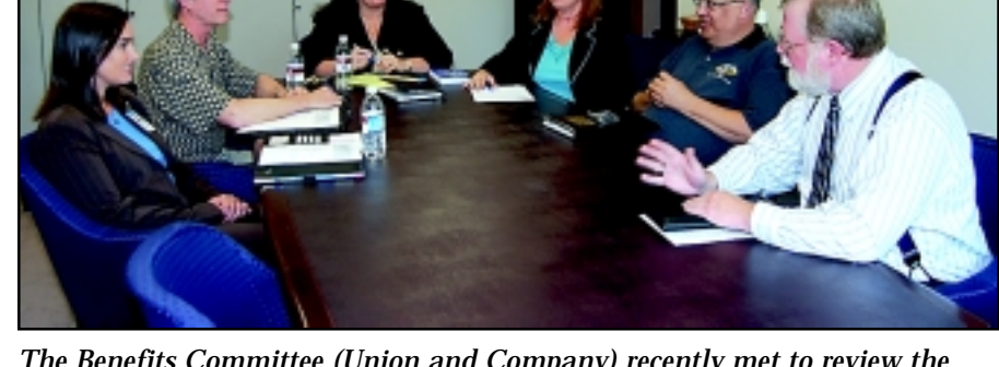
The Benefits Committee (Union and Company) recently met to review the process for diverting the lump sum to VIP, as well as discussing preliminary annual enrollment results, receiving a wellness program update and reviewing other important benefit issues.

tails in the September District 751 Aero Mechanic newspaper. In addition, eligible members will be sent instructions later this year on when and how to elect