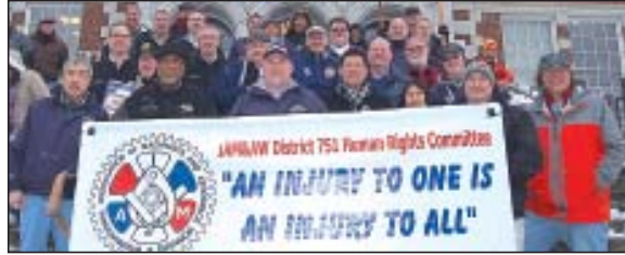
Some of the 50+ participants from 751 pose behind the Union banner before the start of the march despite snowy conditions.