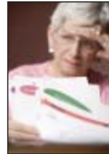
Seniors may qualify for reduced bills from Seattle City Light.

To apply, you'll need to provide income information for all members of the household and information about your home. To find out more or get an application, visit www.seattle.gov/UDP or call 206-684-0268. That single application could also qualify you for assistance with your water, sewer and garbage bills.