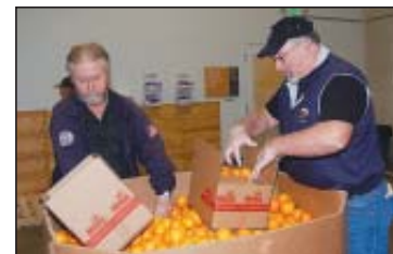
Above and left: Stewards and their family members packaged 20,900 pounds of oranges for distribution to area families.