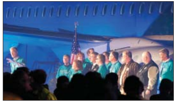
At the second shift celebration, Boeing asked Union leaders to share the stage during the formal program to symbolize the significant role the Union played in ensuring the 737 MAX is built in Renton.