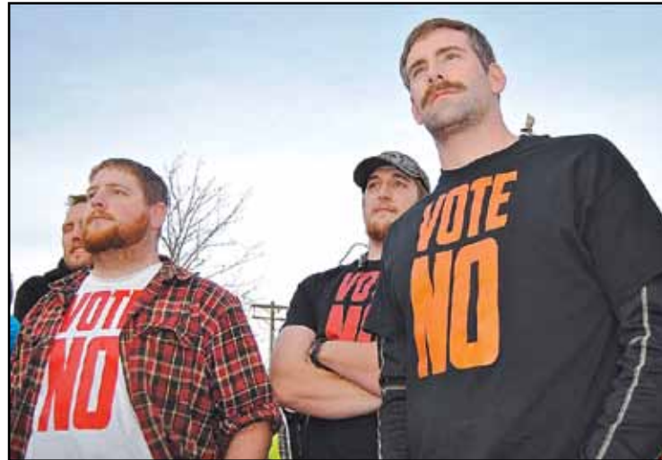
Everett Machinists attend a Nov. 11 rally against Boeing's first 777X contract offer. The company's latest offer is largely unchanged from the one District 751 members rejected by a 2-to-1 margin on Nov. 13.

Boeing is demanding an eight-year contract with drastic concessions in retirement and health care benefits and tiny guaranteed wage increases – 1 percent every other year – in return for vague promises of making Washington state the home for Boeing's 777X jet, which is the latest derivative model of Boeing's best-