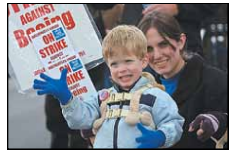
Time on the line is often about building a brighter future for our children.

This is being done by a company making record revenue, record profits, and with its stock at record prices. Should we turn our backs on the history and heritage of our union? Should we throw away all the days we spent on the picket lines. Are we willing to hand over a diminished future to our children and those that follow us working to build these great airplanes we have devoted our careers to, to give away our middleclass status? All of that in exchange for promises we know the Company may not keep? WE SAY NO!!!