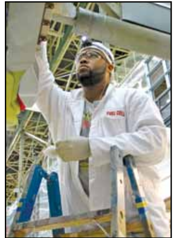
District 751 Machinists are the best aerospace workers in the world.

"Our members would dearly love to continue our 20-year legacy of 777 success by building the 777X here," he said. "At the same time, Boeing's customers and shareholders need to know that the company can deliver on the promises it has made. Given those two facts, I believe that Boeing will end up reaching the same conclusion that I have, that the 777X program must take flight here in Puget Sound."