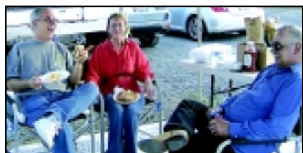
A solidarity barbecue united members at Pexco for upcoming negotiations.