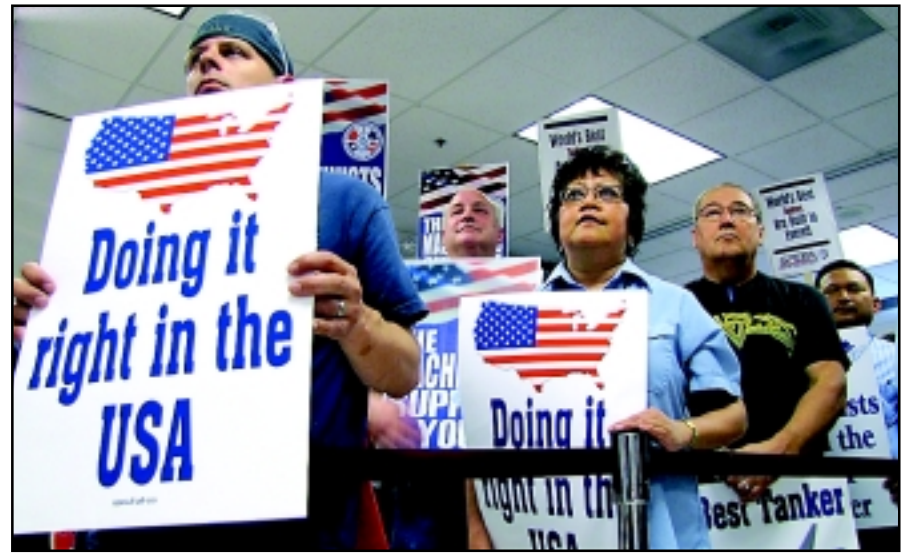
Members remain enthusiastic and optimistic that they will be selected to build the Air Force Refueling Tankers.

"The next rally we have here," he predicted, "will be a victory rally for the American worker."