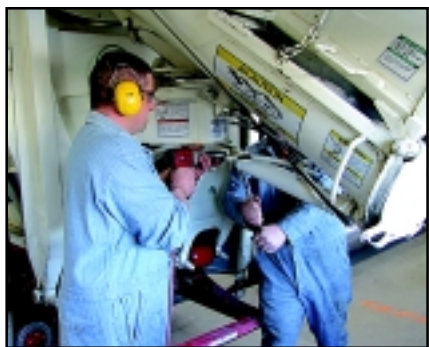
Photo left: IAM members keep the heavy equipment in top running condition at Central Pre-Mix Concrete.