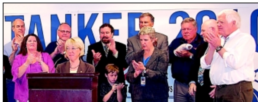
Senator Patty Murray and much of the Washington Congressional delegation addressed the crowd at 751's Everett Hall as the new tanker bid was submitted.