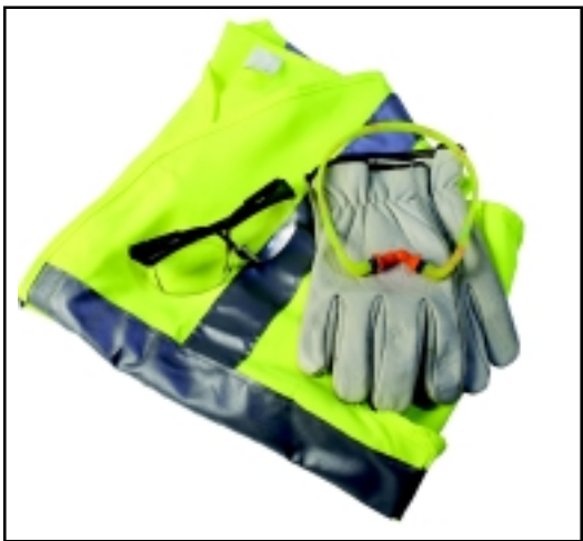
Always be aware of the proper personal protective equipment needed to perform your job.

• Overhead Material Handling – To protect from falling objects, wear an American National Standards Institute-approved hardhat; safety glasses and safety shoes also are essential; and cut-resistant gloves are important if you're handling sharp edges.