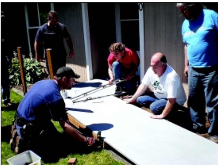
MVP volunteers secure the painted plywood on the Marysville ramp. The ramp was for the daughter of a member who works on the 777 line in Everett.