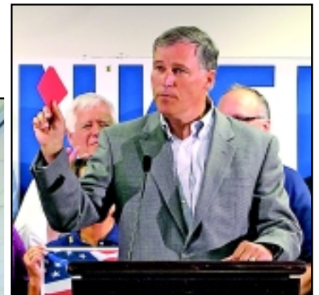
Above: Congressman Jay Inslee declared, "We're going to give Europe a red card and are not going to allow cheating in Europe to take away jobs in America."

Left: Stewards, SPEEA members and concerned citizens turned out for the July 9 rally.